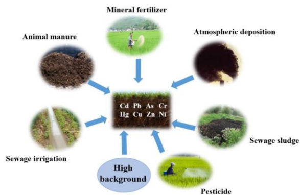
Fig 1. Ways of heavy metals entering the soil. Heavy metals enter the soil from natural sources such as rock erosion and volcanic activity, as well as from human sources such as industries, sewage, fertilizers, and contaminated fuels. The accumulation of these elements in the soil over time causes a decrease in fertility, environmental pollution, and threatens the health of humans and living organisms.

Incorporating vermicompost with soil and potting soil can lead to increased plant growth (Atiyeh & et al, 2001). In general, planting media can reduce the toxicity of these elements to plants due to the complex formation between heavy metal ions and soil organic matter (Perminova & Hatfield, 2005).